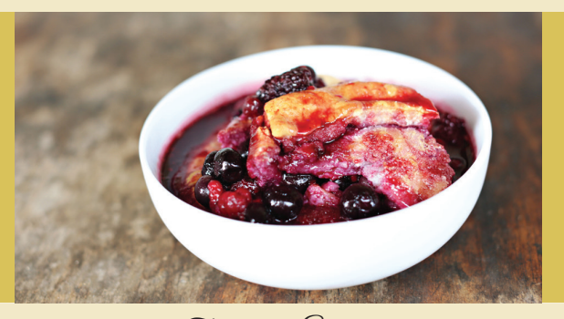
Types of Sonker

The crusts vary. Some recipes call for a pie-like crust, while others call for a bread-crumb topping. Sometimes sonker is made in a pot on the stove, with a crust that is more akin to dumplings.